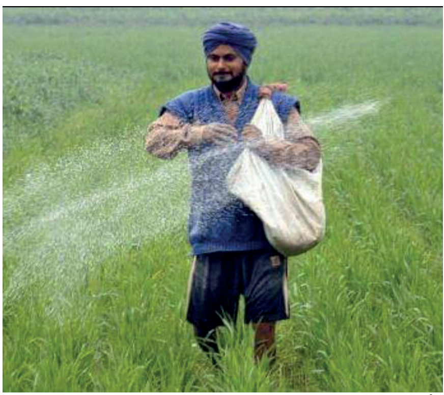
Neem coated urea – from decision to farmer's field

The initial evaluation of the program by third party institutions shows that because of government's bold step, urea usage has become more efficient and wastage and diversion has decreased.