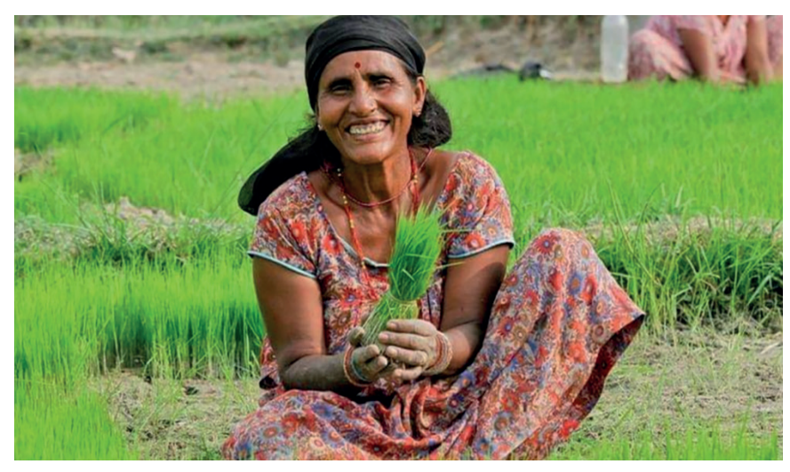
Neem coated urea - farmers are happy

There has been no major incidence of shortage of urea in the last five six years in any part of the country since the decision was taken and farmers are happy that genuine and neem coated urea is being made available to them by government at affordable prices, in the right time and in adequate quantities.