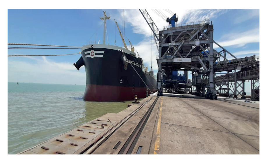
Neem coating infrastructure was put in place in all ports in record time

It was with this background that in 2015, the Government of India took a transformational decision to introduce 100 % neem coating on all subsidized agricultural grade urea in the country. All the indigenous and imported urea were neem coated so as to make the urea slow release and difficult to use for non-agricultural purposes.